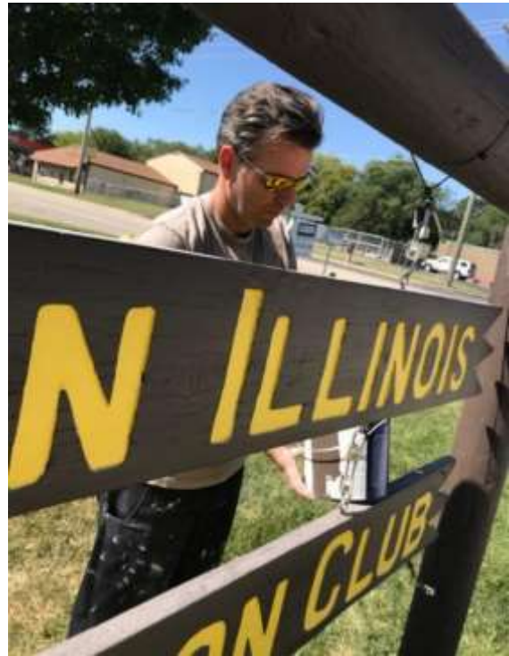
Working to perfection