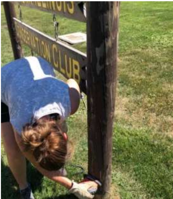
Ship shape from top to bottom