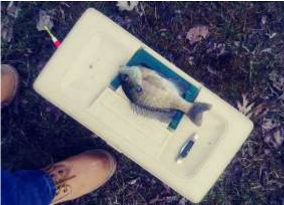
Bluegill caught by Jim Waldow

With the current shelter in place/safer at home orders that have come down by state government, NICC has seen an increase in grounds use. This is what the grounds are for, to get out and enjoy a walk on the trails or try your luck at fishing the pond. We have had members doing all of this and posting pictures on the NICC members only Facebook page.