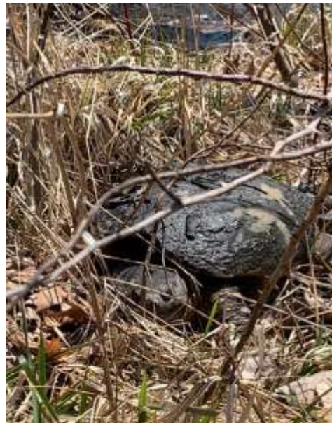
Large snapping turtle waking up after a long winter rest