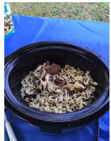
Venison Stroganoff with Noodles