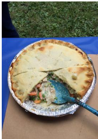
Pheasant Pot Pie