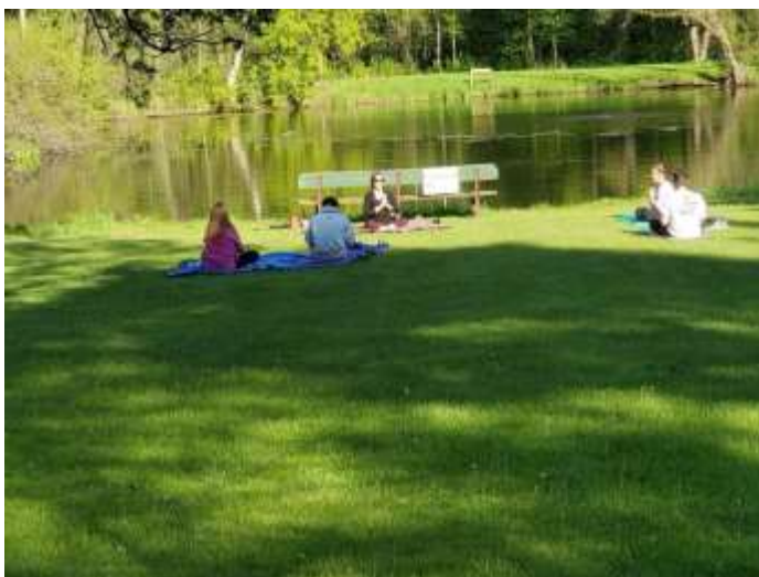
Pop Up Yoga Class on May 13.

What a beautiful setting for an outside Yoga Class. Next time we have a Pop Up Yoga Class, bring a friend and enjoy the peace and tranquility of our grounds. There is no age limit. The gentleman in the photo at the right, is 95 years young.