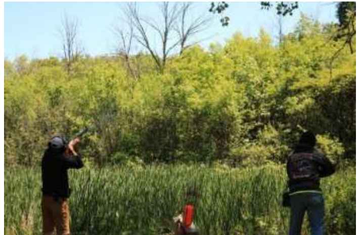
Pop Up Trap Shoot held on June 14