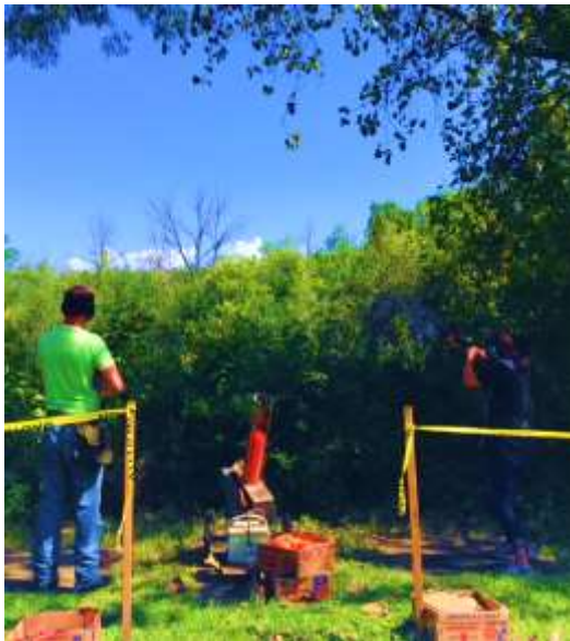
Waiting for his turn