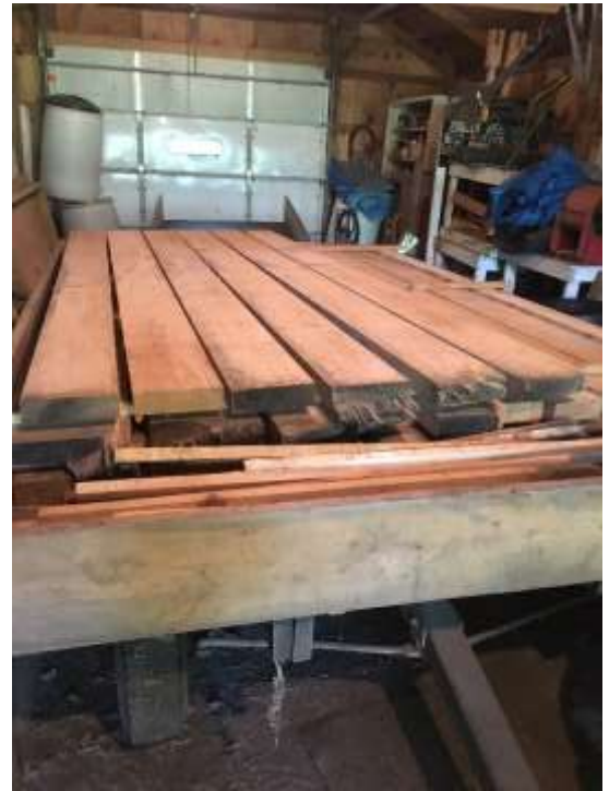
Stacked in the barn