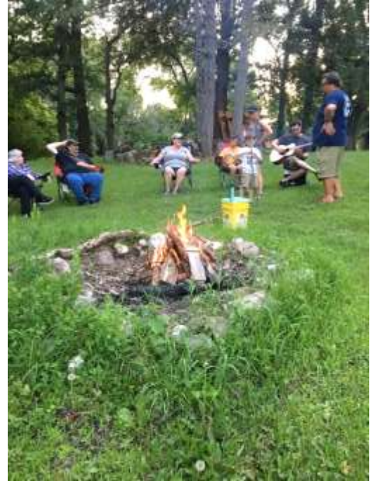
Friday June 29 Campfire