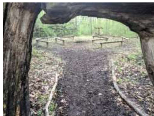
Cub Scout Pack 191 came to the club grounds on May 19, to do a service project in the afternoon. In the evening, they had a campfire where the boys received the ranks they've worked all year for. Afterwards, they christened the north fire ring by having s'mores.